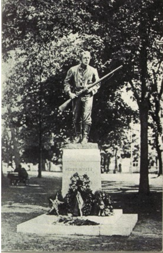
Monument to Henry Wyatt:

December 20 - Went uptown to-day on French leave, and when I returned was put on guard duty for going.