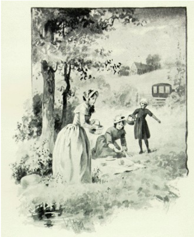
"Lunch by some cool, shady spring."

Our own ancient carriage my sister styled "the old ship of Zion," saying it had carried many thousands, and was likely to carry many more. And our driver we called the "Ancient Mariner." He presided on his seat - a lofty perch - in a very high hat and with great dignity. Having been driving the same carriage for nearly forty years - no driver being thought safe who had not been on the carriage box at least twenty years, - he regarded himself as an oracle, and, in consequence of his years and experience, kept us in much awe, - my sister and myself never daring to ask him to quicken or retard his pace or change the direction of his course, however much we desired it. We will ever remember this thralldom, and how we often wished one of the younger negroes could be allowed to take his place; but my grandmother said "it would wound his feelings, and, besides, be very unsafe" for us.