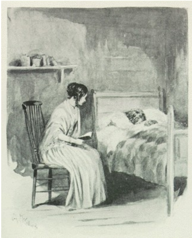
"Reading and repeating verses to him."

I once attended a gay party where the young lady of the house, the center of attraction, hearing that one of the negroes was suddenly very ill, excused herself from the company, carried her prayer-book to the cabin, and passed the night by the bedside of the sick man, reading and repeating verses to him. I have also had young lady friends who declined attending a wedding or party when a favorite servant was ill.