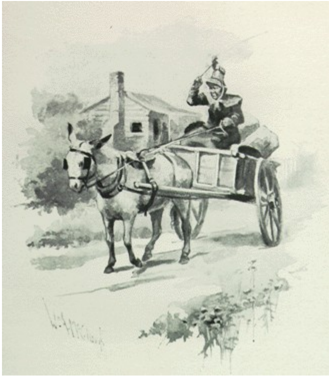
"She always returned in a cart."

On some plantations it was a custom to buy the wife when a negro preferred to marry on another estate. And in this way we became possessed of a famous termagant, who had married our grandfather's gardener, quarreled him to death in one year, and survived to quarrel forty years longer with the other negroes. She allowed no children about her cabin - not even a cat or dog could live with her. She had been offered her freedom, but refused to accept it. Several times she had been given away - once to her son, a free man, and to others with whom she fancied she might live - but, like the bad penny, was always returned to us. She always returned in a cart, seated on top of her wooden chest and surrounded by her goods and chattels; She was dressed in a high hat with a long black plume standing straight up, gay cloth spencer, and short petticoat, - the costume of a hundred years ago. Although her return was a sore affliction to the plantation, my sister and myself found much amusement in witnessing it. The cold welcome she received seemed not to affect her spirits, but, re-establishing herself in her cabin, she quickly resumed the turbulent course of her career.