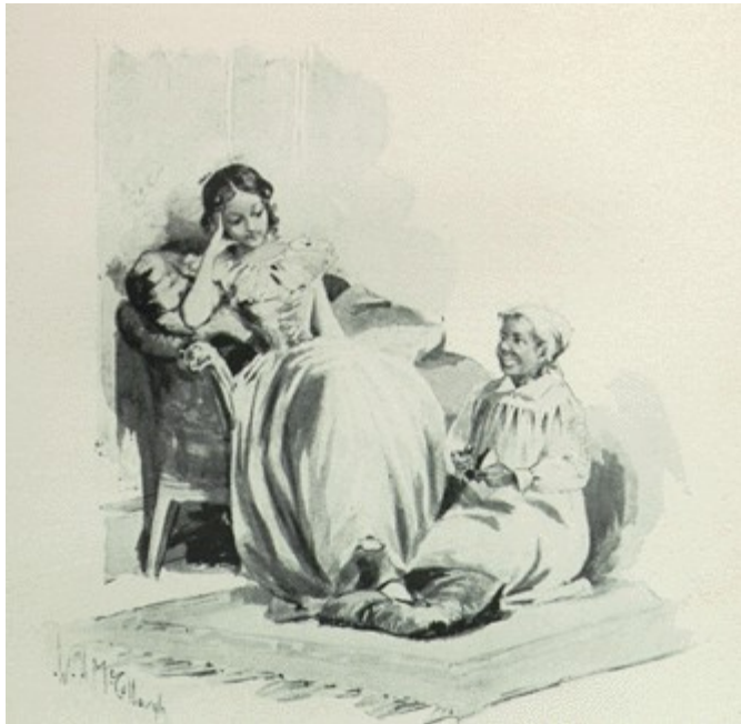
"Accompanied by one of these smiling 'indispensables'"

The negroes were generally pleased at the appearance of visitors, from whom they were accustomed to receive some present on arriving or departing; the neglect of this rite being regarded as a breach of politeness.