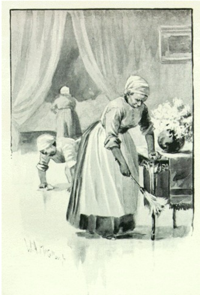
"Three women would clean one chamber."

Indeed, in our part of the world, a mistress became offended if the faults of her servants were alluded to, just as persons become displeased when the faults of their children are discussed.