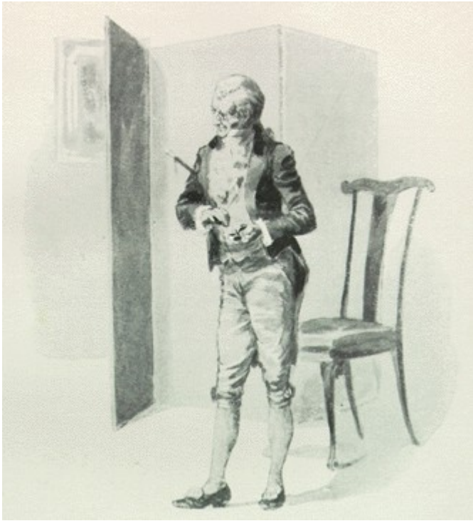
"There were old gentlemen visitors."

Then there were old gentlemen visitors, beaux of my grandmother's day, still wearing queues, wide-ruffled bosoms, short breeches, and knee buckles. These pronounced the a very broad, sat a long time over their wine at dinner, and carried in their pockets gold or silver snuffboxes presented by some distinguished individual at some remote period.