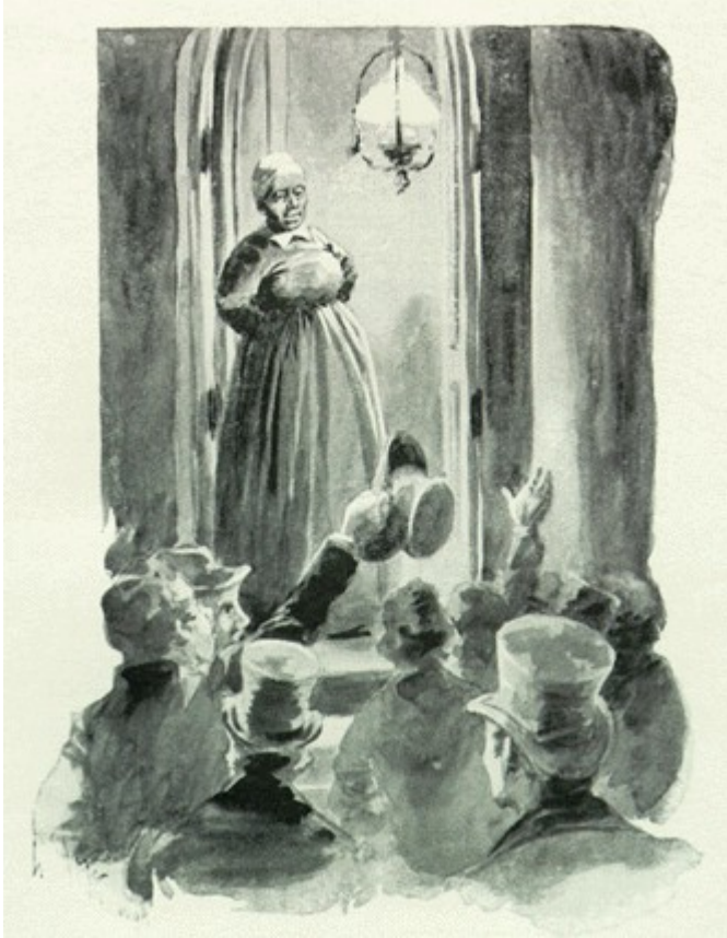
"Aunt Fanny 'spersed dat crowd."

With arms akimbo, and looking at him with astonishment but with firmness in her eye, she replied: "Couldn't possibly do it, Mars' Charles; because soap, sir, soap's my main-tain-ance!"