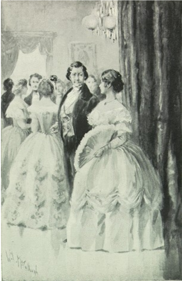
An Evening Party