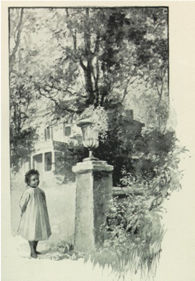
"I use to watch for de carriage."