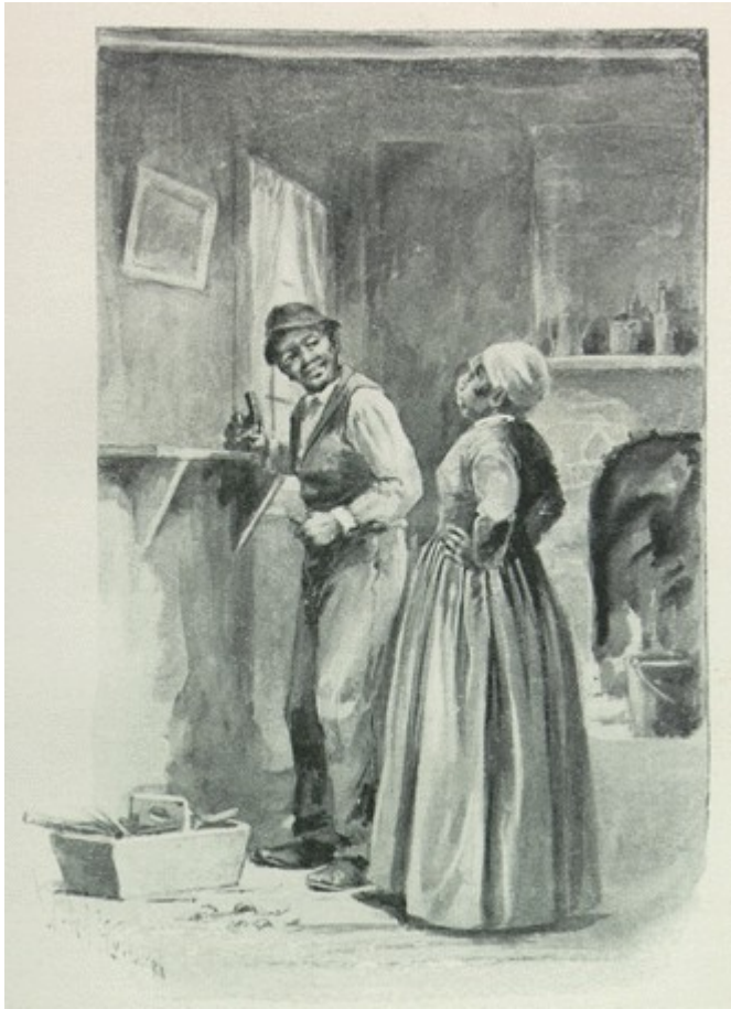
Carpenters always work for the comfort of the plantation.

Many could read, and in almost every, cabin was a Bible. In one was a prayer-book, kept by one of the men, a preacher, from which he read the marriage ceremony at the weddings. This man opened a night school - charging twenty-five cents a week - hoping to create some literary thirst in the rising generation, whose members, however, preferred their nightly frolics to the school, so it had few patrons.